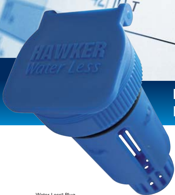
Water Less® Plug

More operating time – Longer topping up intervals